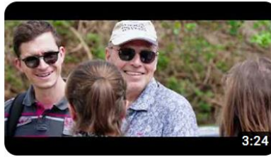
Let's go pour les 90 ans de la Traction avant

You'll find these videos on our Youtube Channel , along with testimonial videos from our foreign correspondants.