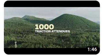
Film promotionnel pour les 90 ans de la Traction avant